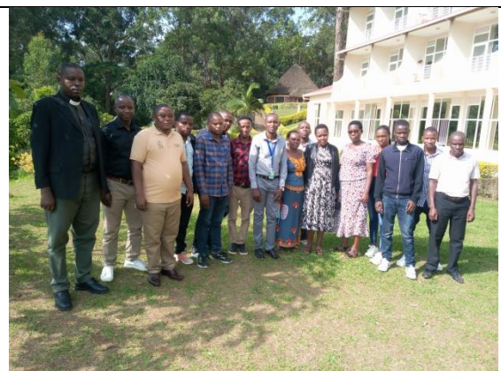
The below photos were taken during the training of Tree Nursery Bed Managers (Bed managers were also trained on Avocado and Mango fruits grafting)