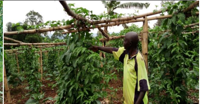
The seedlings planted are cared so that he will have a good production