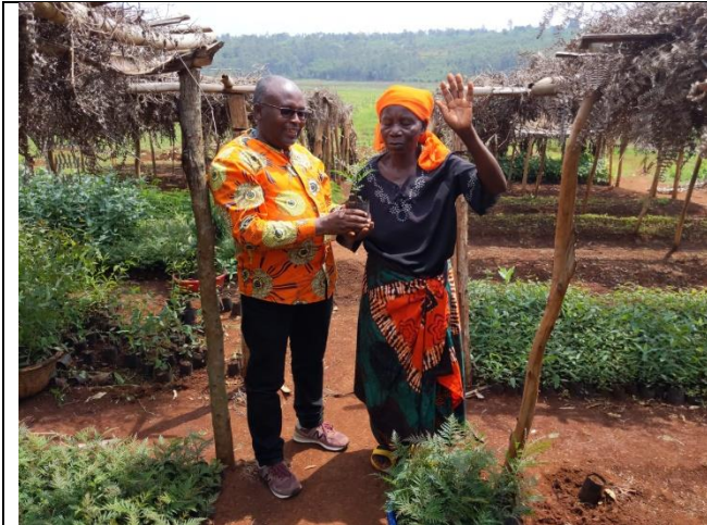
The opening of trees distribution in Nzahaha Sector by Nzahaha Social affairs officer

The following photos show how the seedlings distributed to the farmers