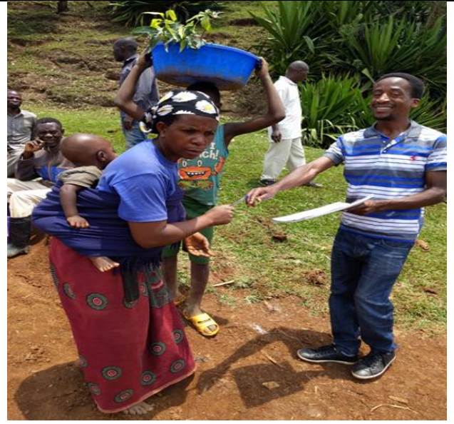
Farmers were given seedling and recorded.

Below two photos were taken during the planning