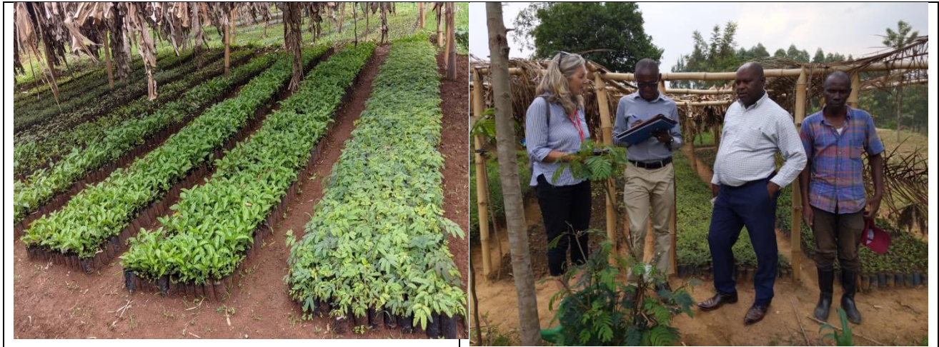
The field work for monitoring and evaluation done Rwanda Action Operations Director, RDIS Project Manager and Field Coordinator and the cooperative manager in Nyakabuye sector.