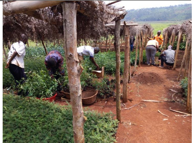
The Farmers were given trees on order.