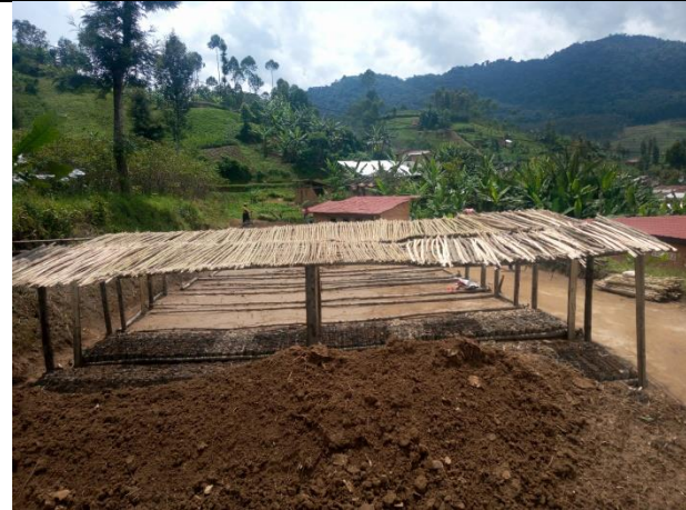
Tree nursery in the construction phase.