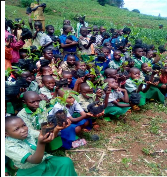
Children at Nkombo were taught about the importance of trees and tree planting