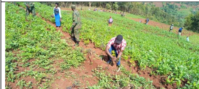
The trees planted in the community work

The opening day of tree distribution and planting took place at Nzahaha tree nursery site. The community work was attended by local leaders, soldiers and farmers. The farmers were mobilized to make sure that trees planted are well secured and followed up so that all trees should survive and grow up in good condition.