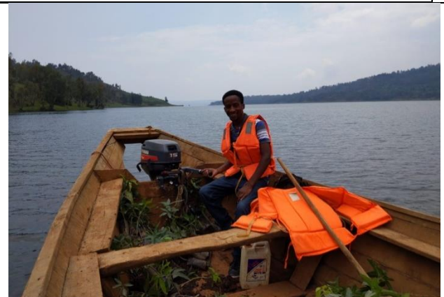
Nkombo sector in collaboration with RDIS was given seedling and transported and planted to Nkombo.