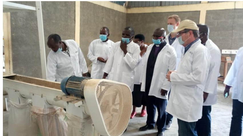
Visiting a rice processing factory in Kamonyi