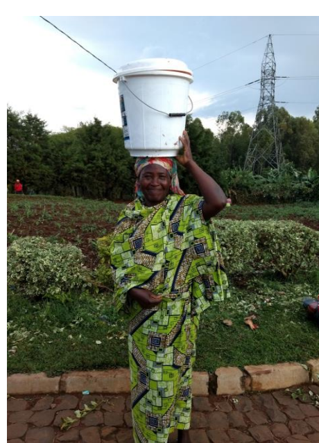
A woman carrying the Ceramic Water Filter from RDIS / Briquettes made from Rice Husks – RDIS is looking for similar project as a way of implementing Waste Management