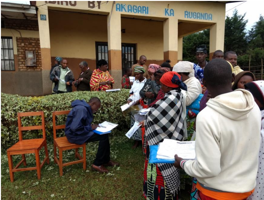
Implementation of the project for Distribution of Improved Cook Stoves and Ceramic Water Filters