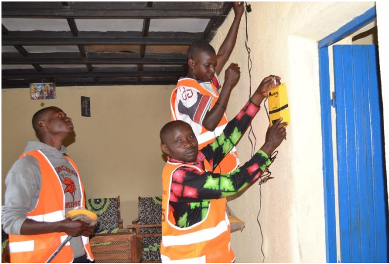
Implementation of the project for Distribution of Solar Home Systems