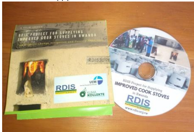
The three versions of the film are also burnt on DVD. Above is an example of the DVD with its cover