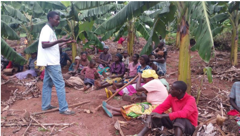
On-going implementation of CCT project