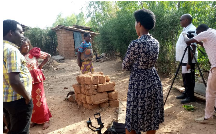
Video shooting team in the field: RDIS staff members, Community leaders, Film producer with his camera man