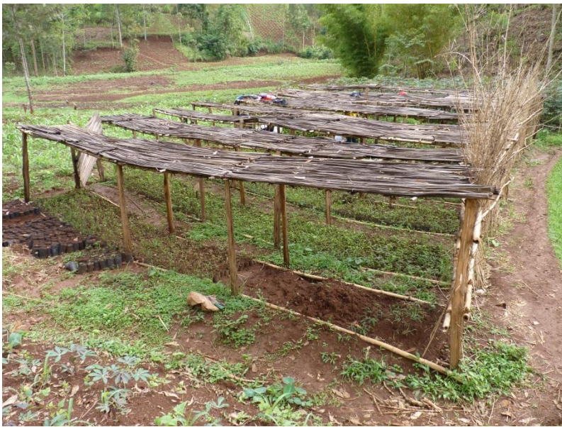
Implementation of the project for Tree nurseries in Cyangungu