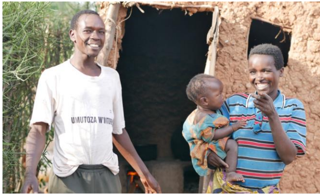
Film making for CCER project Some of our happy beneficiaries to be seen in the film