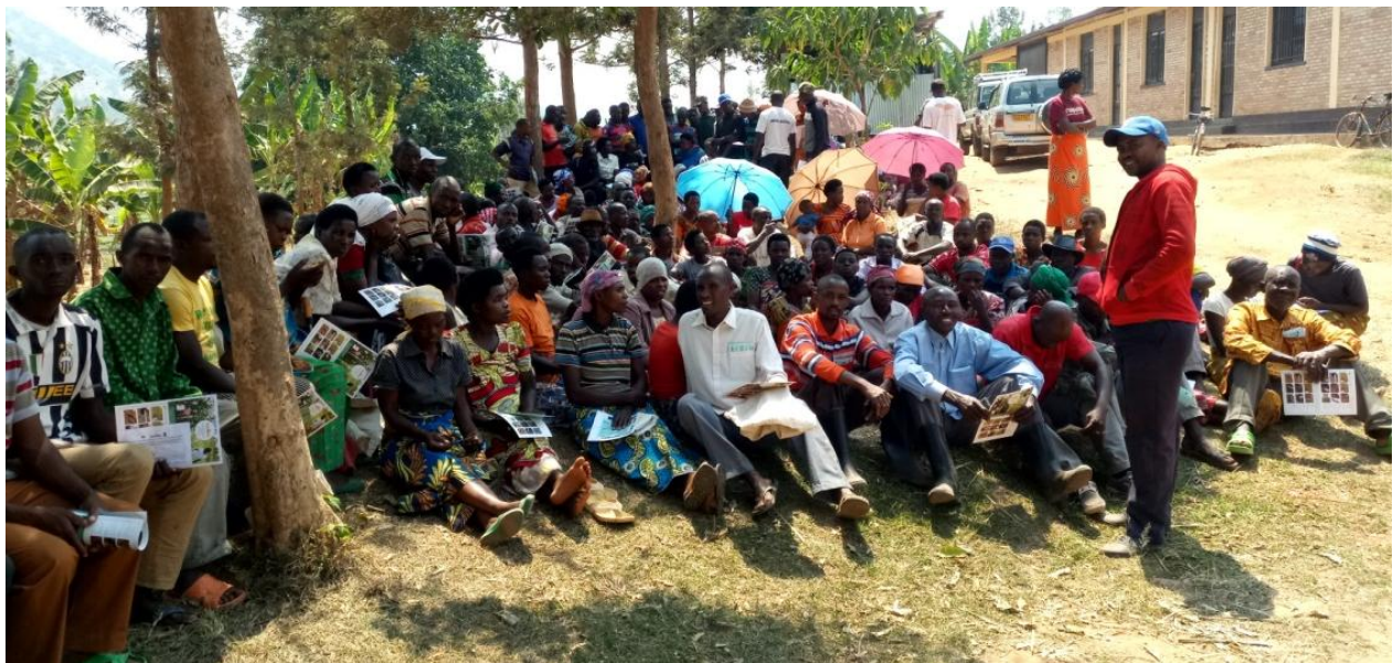
Figure 1: Villagers from Cyiri cell during the meeting

This special event started at around 10:30 with a meeting, where the executive secretary of Cyiri cell welcomed the invited guests. Prior to that, she thanked RDIS organisation for bringing the project for Supplying Solar Home Systems in her work area as it will improve the livelihood of the people who until now had no electricity in their homes.