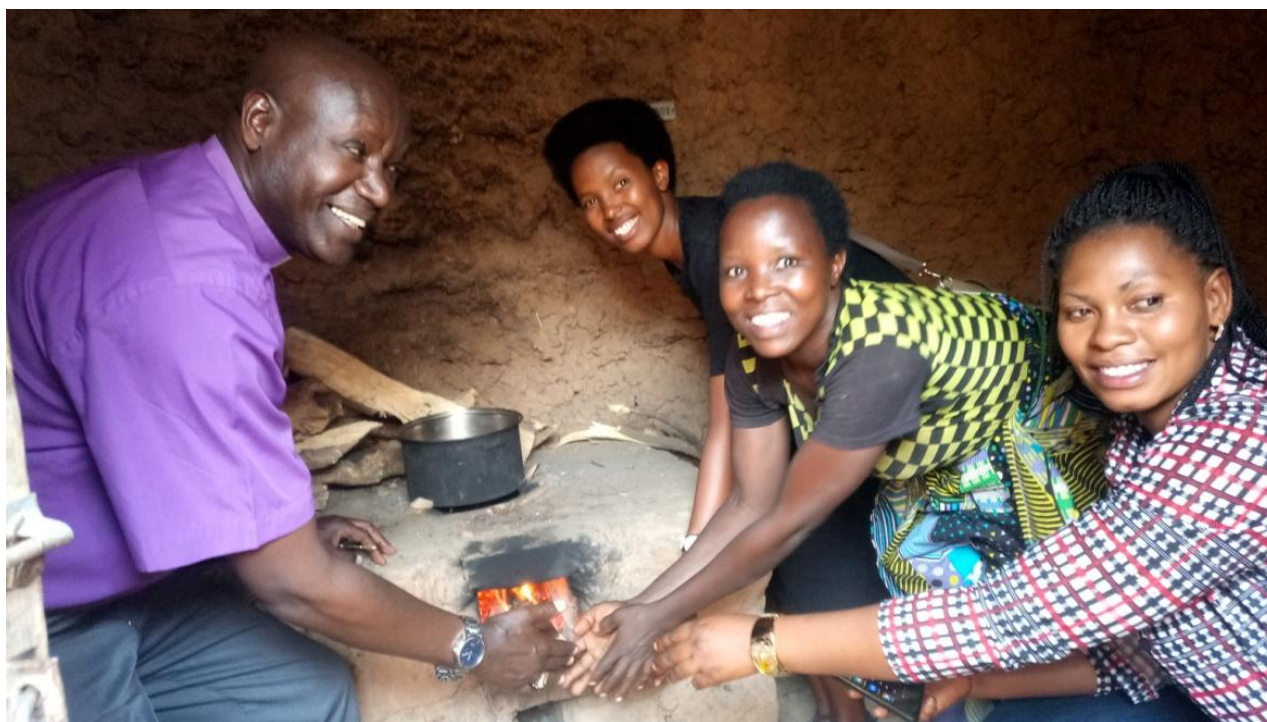
Figure 5: RDIS’s improved cook stove in use

The two UEM member Churches above are in essence implementing an environmental protection project by investing in renewable energy sources (Solar energy), whereby the invested capital will have to be paid back.